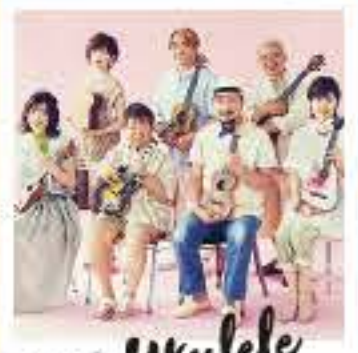
1933 Ukulele All Stars